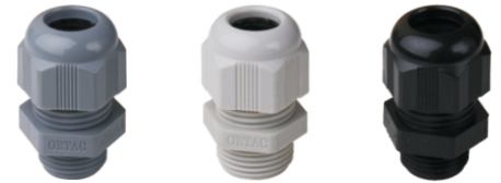
■ RAL 7001 ■ RAL 7035 ■ RAL 9005